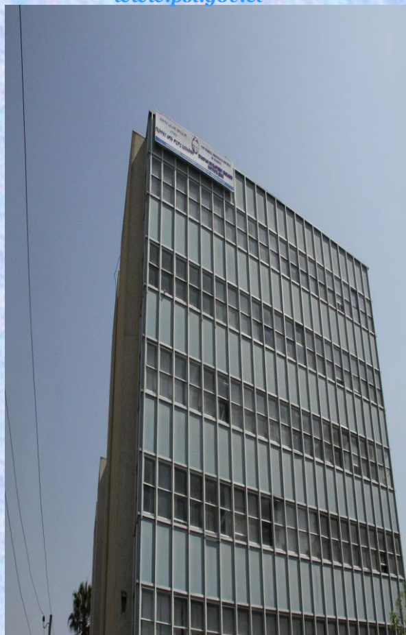
PSI's Head Office